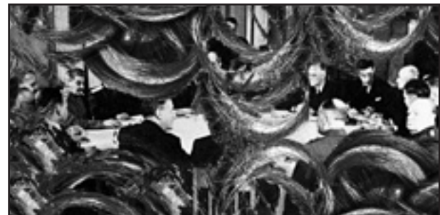
Joseph Stalin at a meeting. The photo was taken by Esther.

Because Esther was an extraordinarily furry cat, no one ever noticed that she came equipped with a Minox. The furriness did create one problem, though -- a big one. Most of Esther's photographs show more fur than anything else (see example, right). Of the more than twenty thousand pictures she produced, only a handful show anything that a human being can recognize. Esther died in 1962. Had she lived and worked a mere three decades later, new image processing technology would have been available to turn her furry photos into useful strategic tools. For Esther the Cold War kitty, opportunity came too soon.