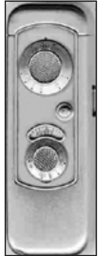
A Minox camera.

The Ambassador showed Esther a very special camera. It was a beautiful little machine, a tiny, kitty-sized Minox (see photo below). The Minox had been designed a decade earlier in Latvia by a Swiss inventor named Walter Zapp. The camera was a mere 75 millimeters long, 13 millimeters high, and 28 millimeters wide -- just perfect for a cat. It weighed 180 grams, and used very small film, just 8 by 11 millimeters. With a Complan 15mm F3.5 (4Ele, 3Grp) lens, a Galilei Bright flame finder, a 0.2 - Infinity thumb wheel dial, shutter speeds from 1/2-1/1000 s, and the ability to shoot from as close as 0.2 m, the Minox was ideal for Esther. All it needed was a way for her to snap the shutter. Esther herself helped devise a paw-activated trip mechanism.